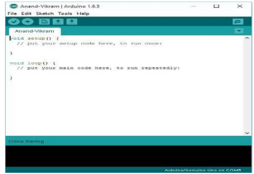
Fig. 6 Arduino IDE Screenshot

The following figure will highlight the screenshot of Arduino IDE.