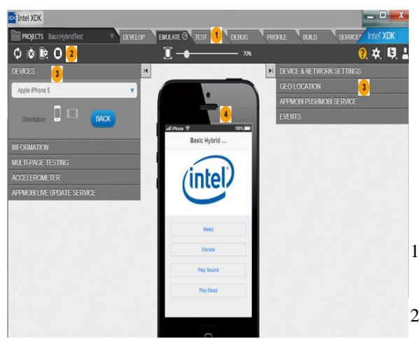
Fig. 5 GUI Interface of Intel XDK

The latest version of Intel XDK is v2727 available on November, 2015.