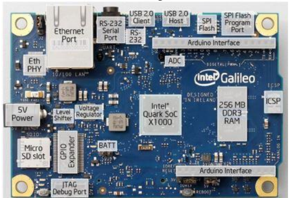
Fig. 1 View of Intel Galileo Board

The following are the Board Components of Intel Galileo: